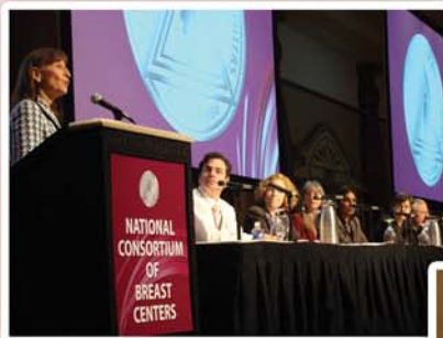
Learning Venues Include Panel Presentations, Lectures and PRO/CON Discussions