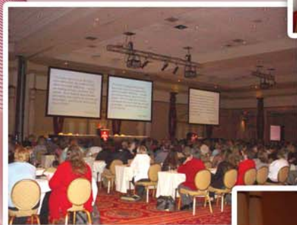
Network One-on-One with Peers from Around the World