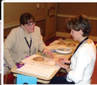
Validate Knowledge and Performance through Certification Programs