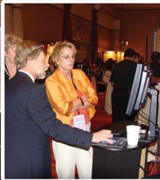
Learn the Latest Breakthrough Products, Technologies, and Techniques