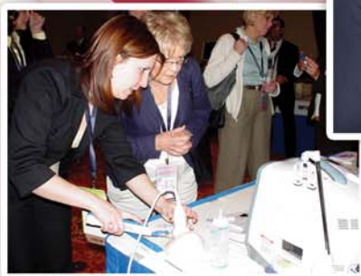
Participate in Hands-On Demonstrations and One-on-One Conversations with Vendors